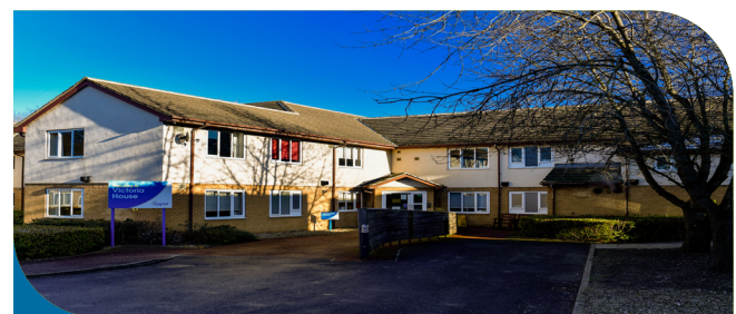
Cygnet Victoria House Barton Street, Darlington, County Durham, DL1 2LN